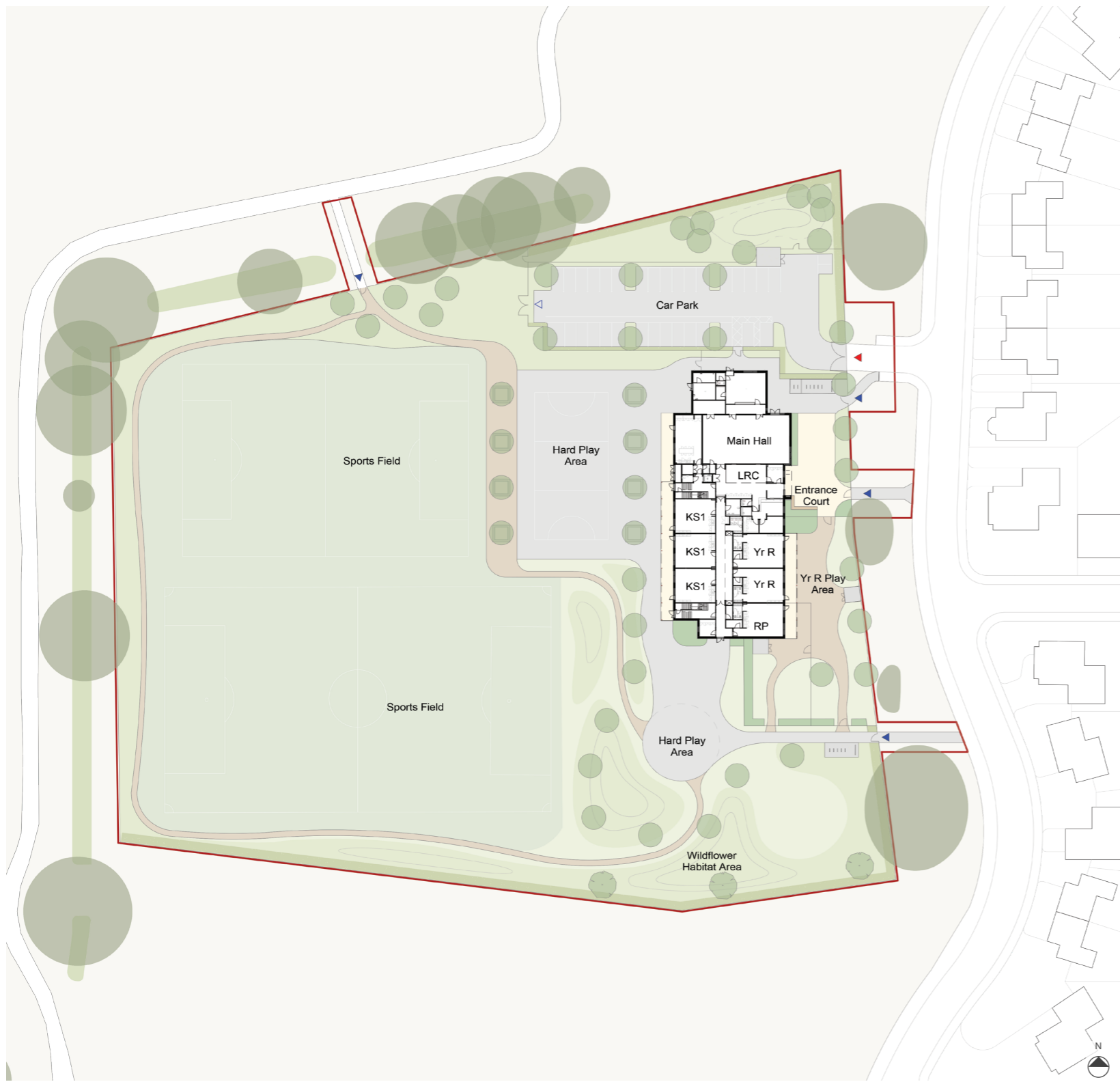
Proposed Site Plan NTS