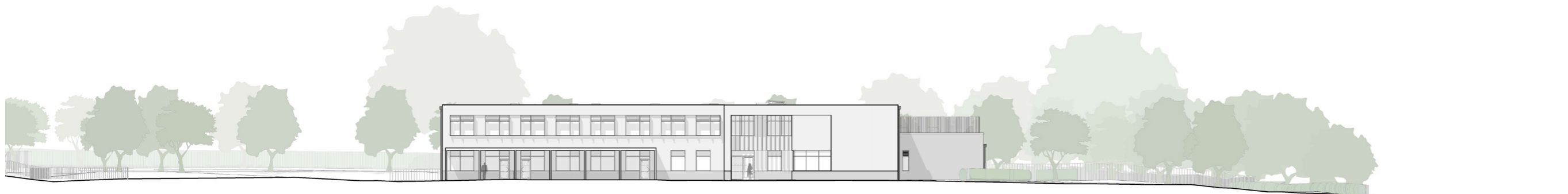
Proposed East Facing Elevation NTS